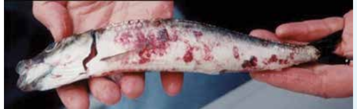
Viral hemorrhagic septicemia (VHS) is an exotic infectious viral disease originally found in the Atlantic and Pacific Oceans. Numerous fish kills have been attributed to VHS on the Great Lakes since 2005, appearing to be an invasive freshwater strain of the once salt water disease.

The approach includes rationale, goal and objective development, guidance for assessment and monitoring, best management practices, and coordination strategies. Attendees will include the Mississippi and Atlantic Flyway Councils and an Ontario wildlife representative, in addition to the CLC.